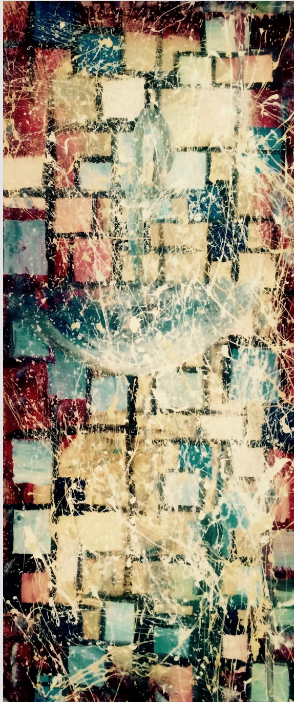
Dreams of Renoir 3' x 8' Acrylic on canvas