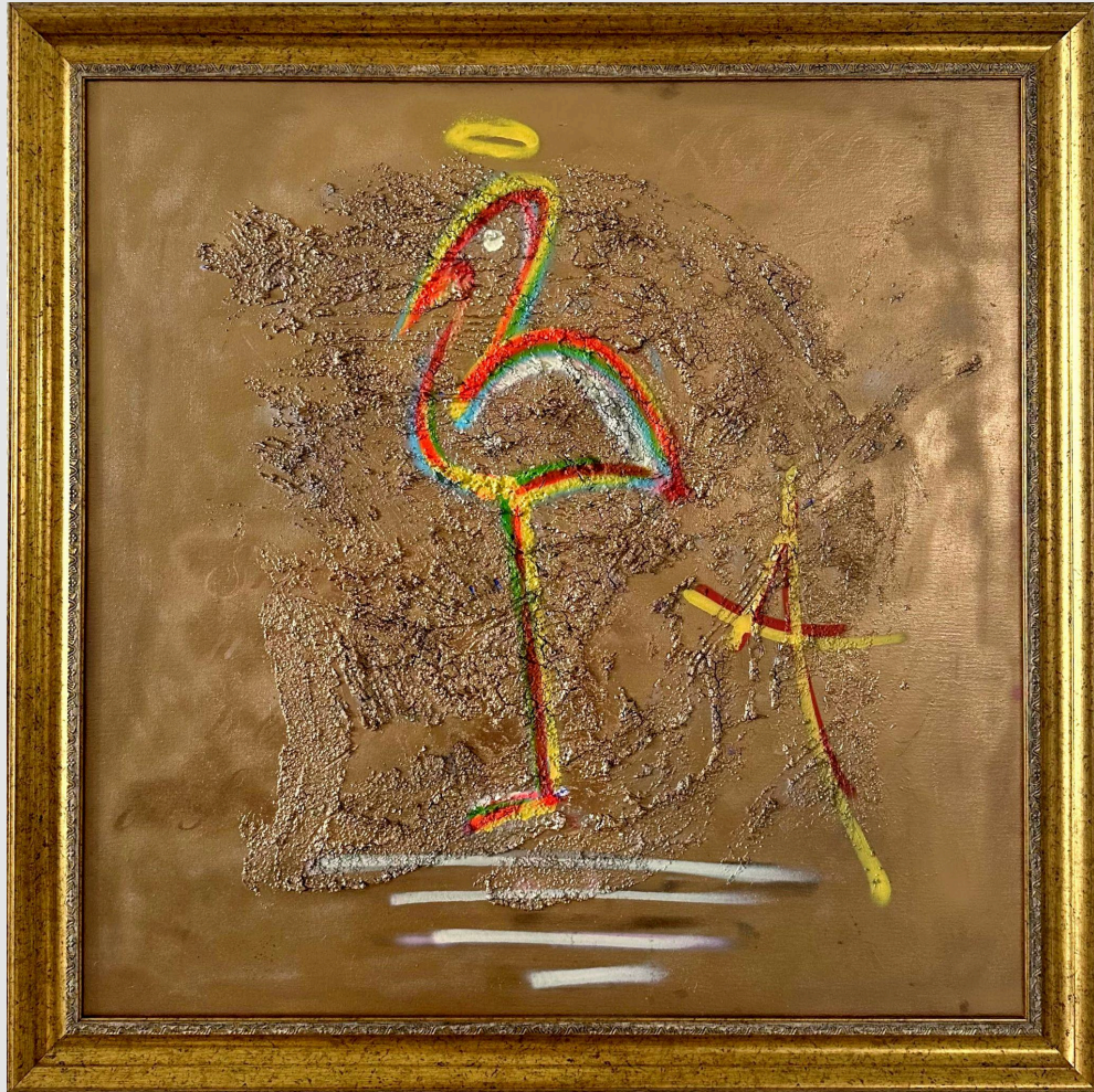
DeChirico Flamingo 36" x 36" plus frame Spray Paint Fresco (Stucco) on Canvas