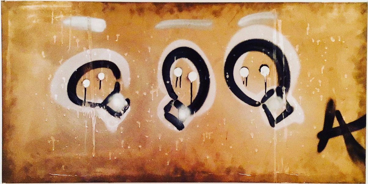
Three Amigos Spray Paint on canvas 36" x 36"