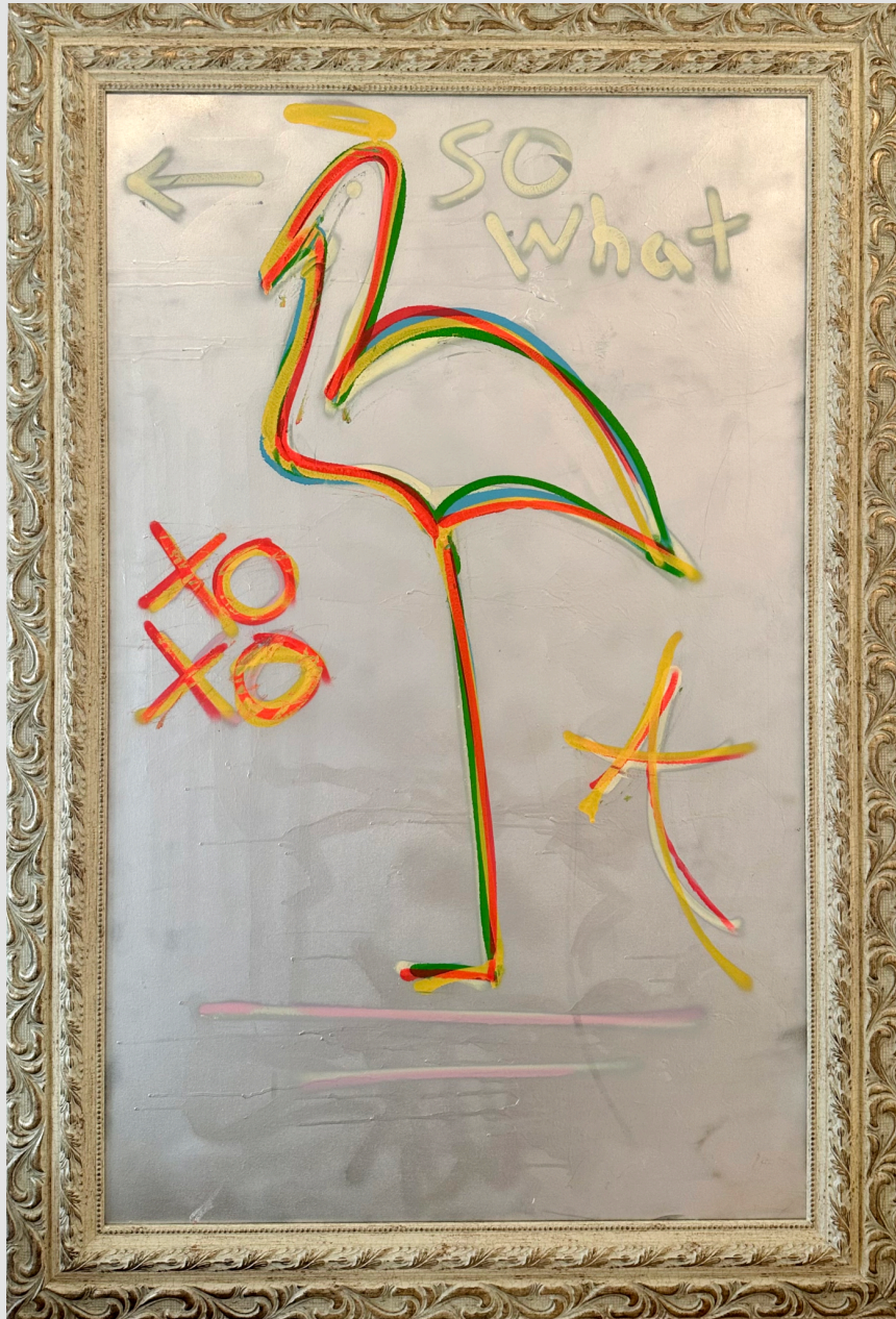
So What? 3' x 4.5' plus frame Spray Paint on Canvas