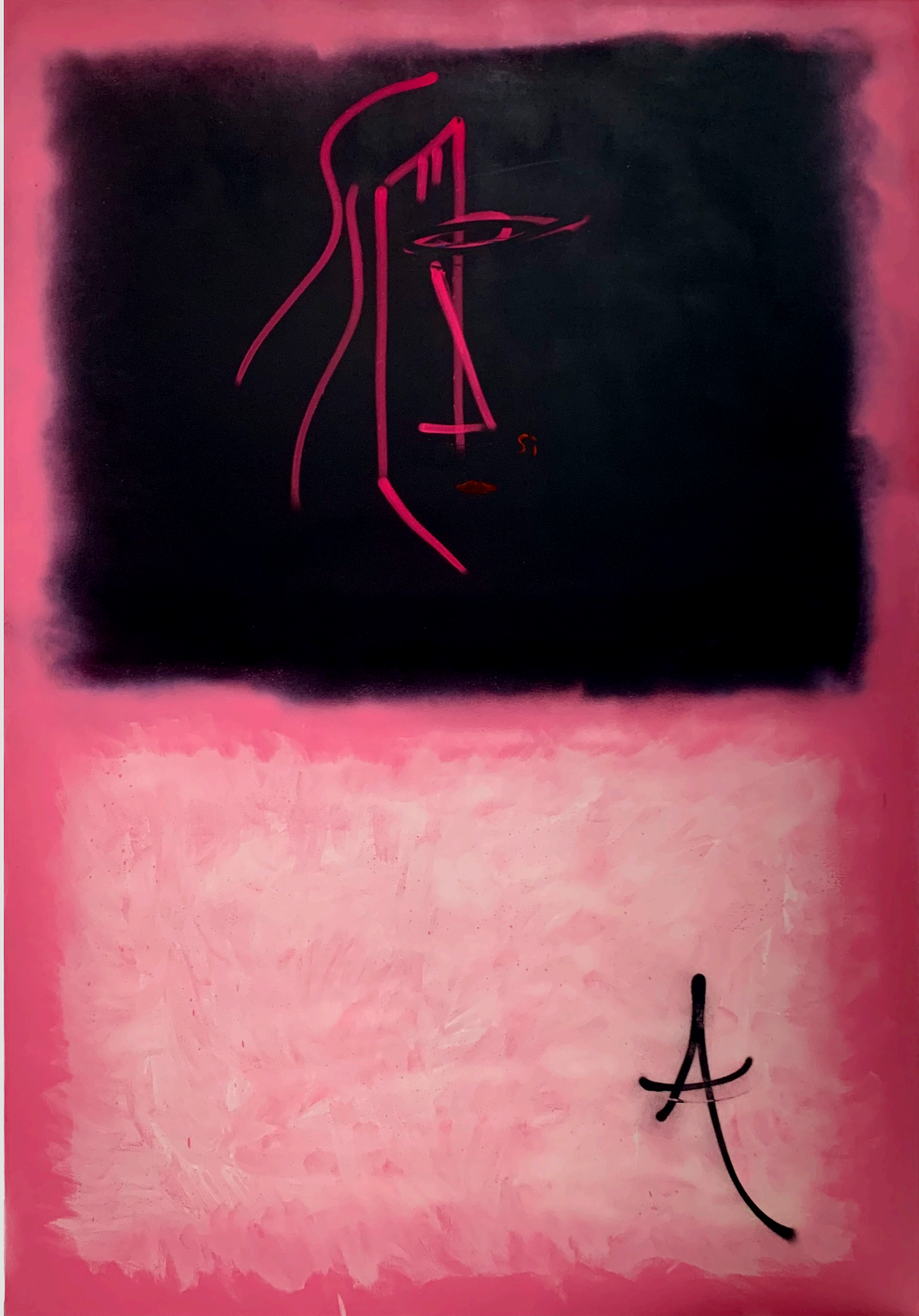
Pretty in Pink 4' x 6' Acrylic and Spray Paint on Canvas