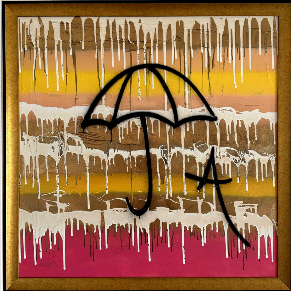
Umbrella Love 36" x 36" plus frame Spray and Tempera Paint on Canvas